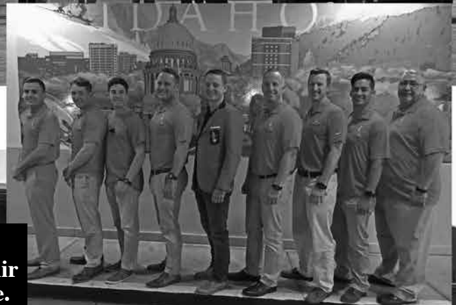
13th Bomb Squadron Reunion, Boise, Idaho, September 18-22, 2019. Tours of the Warhawk Air Museum, Idaho State Capitol and Basque Village.